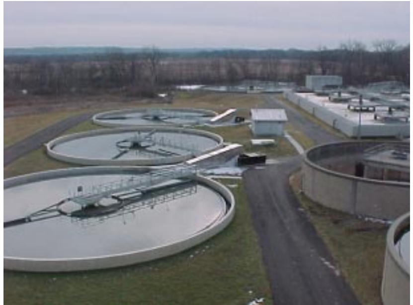
The City of Hamilton treatment facility.

The city-owned City of Hamilton wastewater treatment facility in Hamilton, Ohio, serves 63,000 residential and commercial customers, in addition to providing full treatment service for one major paper mill and secondary treatment for a second paper mill. The two paper mills produce approximately 60% of the facility's total flow.